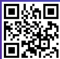
ACADEMIC RESOURCE HUB