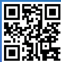
STUDENT HOME PAGE